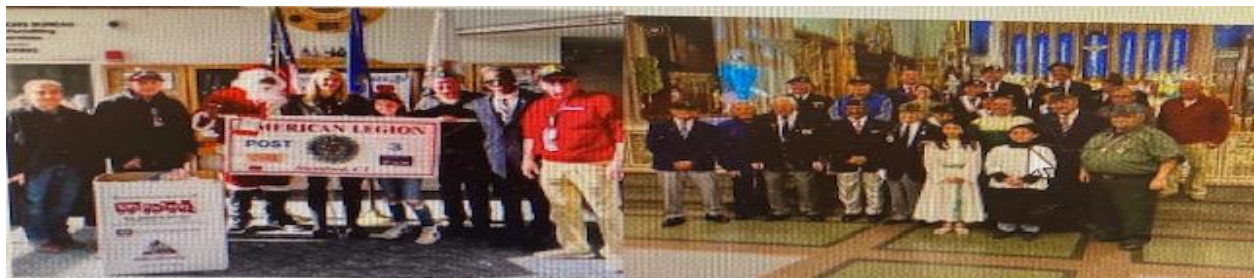
LEFT: Members of KC proudly coordinating and volunteering with Toys for Tots Right: Honor Guard participating in Veteran Mass at St Mary in Stamford